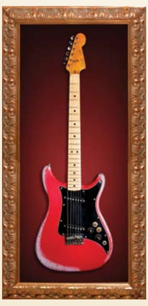
© 2009 Hard Rock Cafe International - 1/09 - F1

Boneless, seasoned and breaded chicken tenders, served with honey-mustard and Hickory Bar-B-Que sauces on the side or tossed in our Classic Rock, Heavy Metal, or Tangy Bar-B-Que sauces. Served with celery sticks and blue cheese dressing.†